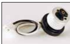
Edison Connector included