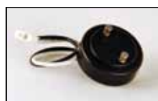
IR-GU24-ADP GU24 Connector additional accessory